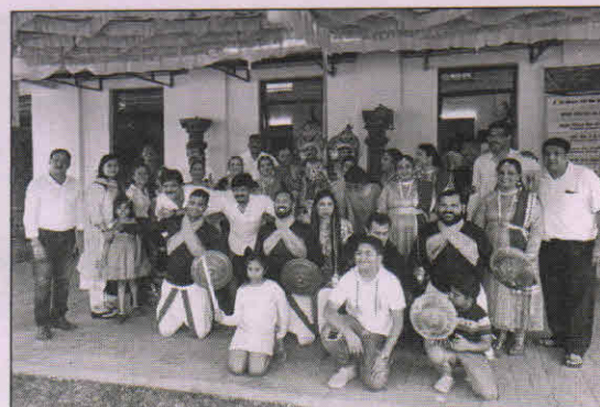
Participants of the Group Dance event from our club who won the 2 nd prize in Zone 2 in Banni Haadona Seri Kuniyona 23-24