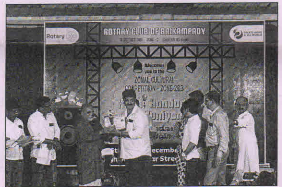
Club receiving the 1 st prize in Skit Competition in Banni Haadona Seri Kuniyona 23-24