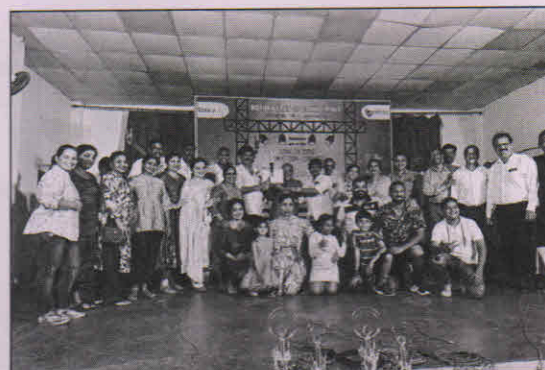
Club receiving the overall 2 nd prize in Zone 2 in Banni Haadona Seri Kuniyona 23-24