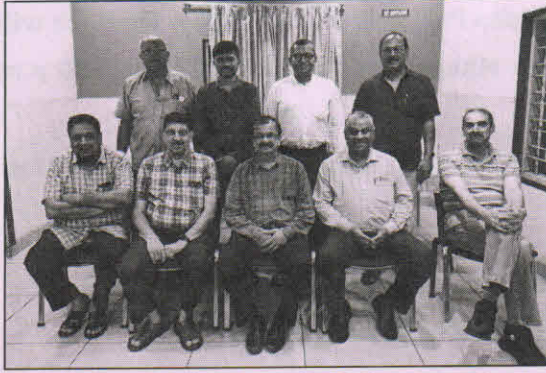
Meeting of the Board of Directors of the Club for January