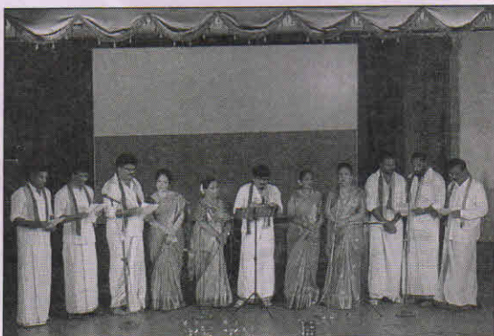
The Group Singing team from our club which won the 2 nd prize in Group Singing event of Zone 2, Banni Haadona Seri Kuniyona 23-24