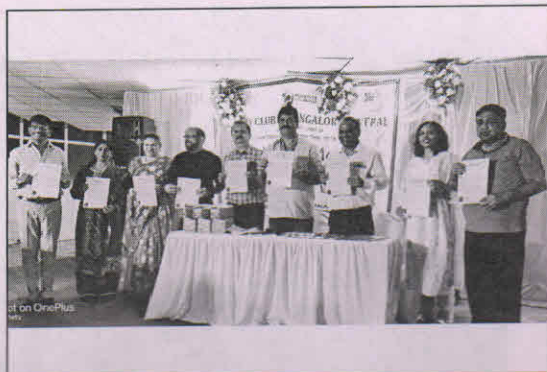
Bulletin Release by the hosts of the family dinner meeting of the club for December.